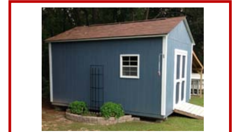
Organizer Plus – 7/12 Pitch, organizer with higher peak includes workbench