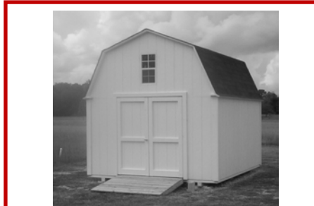
Gambrel Classic Barn Ample Loft Space