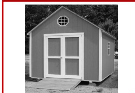
Alpine- 9/12 Pitch Cottage Shed