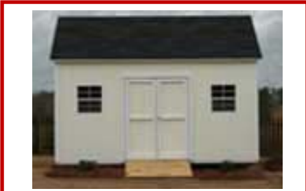
Gable Organizer- 5/12 Pitch Most Popular